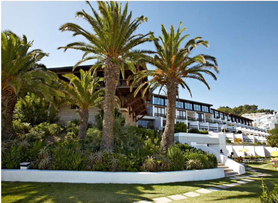
Hotel Do Mar, Sesimbra.

Sesimbra is a charming town located 42 km south of Lisbon in the Setúbal district, home to a small yet significant fishing port. Nestled in an area of natural beauty, Sesimbra is known for its stunning white sandy beach, kissed by the turquoise waters of the Atlantic. A scenic boardwalk runs along the beach, extending the length of the town. This vibrant locale features narrow streets that open into small piazzas, lined with quaint shops and restaurants offering delicious locally caught fish dishes. There's plenty to do in Sesimbra, from engaging in sea sports to hiking in the nearby national park. Visitors can also explore the town's historic buildings and discover the rich cultural heritage of the region.