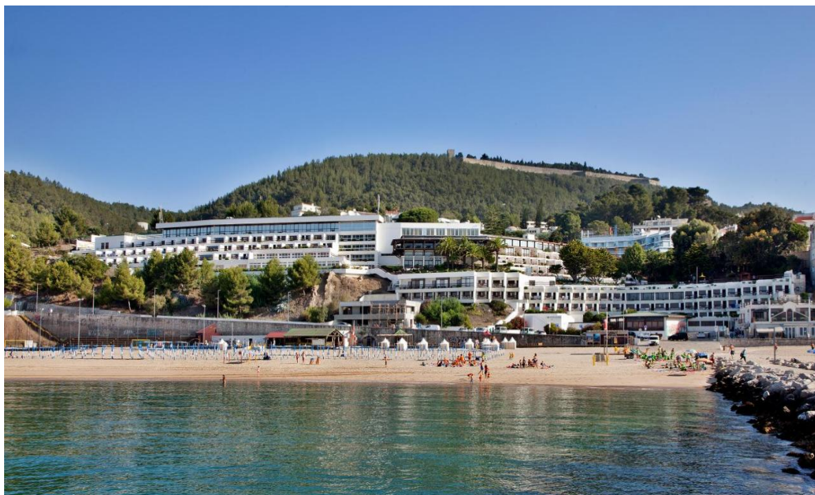
Hotel Do Mar, Sesimbra Portugal.

Hotel Do Mar, Sesimbra is a beautiful 4 star, modern bright and airy hotel with a Portuguese interior flavour and a warm bohemian feel. The hotel offers a atmosphere of tranquillity right from the minute you stand in the reception area. Every window in the hotel including all the bedroom windows/balconies face down on to the wonderful panoramic view of the Sesimbra beach and the Atlantic ocean. From the hotel access to the beach and Sesimbra town is via elevators that bring you directly down unto the broadwalk and the beach. Sesimbra is a vibrant town in the Portuguese tradition of narrow streets leading to small piazza's. The town is very much a centre for locals and apart from the attraction of the beach there are lots of café's shops and restaurant's to browse or sit and watch the world go by The Hotel is renowned for its calm and comforting surroundings, good food, large indoor and outdoor swimming pools, Turkish baths, jacuzzi, cold baths and Sauna rooms.