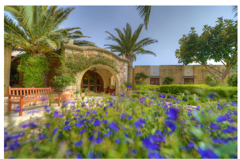
Hotel Ta Cenc, Sannat Gozo, Malta