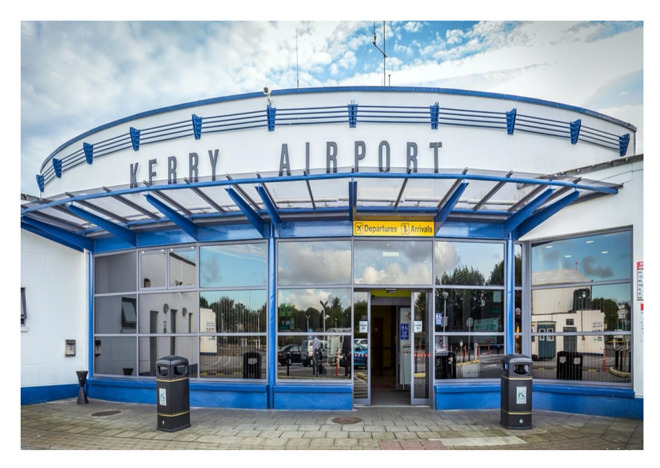
Kerry (Farranfore) Airport

By Air from Dublin - Ryanair (www.ryanair.com) from Dublin Airport to Kerry (Farranfore) Airport with a flight time of around 1 hour. Ryanair flights arrive and depart from Terminal 1 at Dublin Airport which is approx. a 10-minute walk from Terminal 2. You can also fly with RyanAir from London Stansted, London Luton and Manchester airports directly to Kerry Airport. Please check the Ryanair departure and arrival schedule for suitable times. While Ryanair is a very affordable way to fly to Kerry, please ensure you book your luggage correctly as they are apt to try to squeeze a few extra euro out of your for excess baggage or baggage not booked correctly.