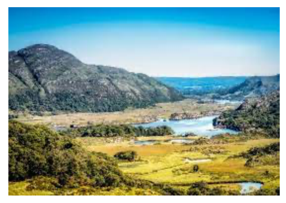
Killarney National Park.

All major international airlines fly into Dublin Airport and "Terminal 2" is the international arrival and departing terminal. You can fly from Dublin Airport to Kerry Airport. You can also fly from London Stansted, London Luton and Manchester airports directly to Kerry Airport.